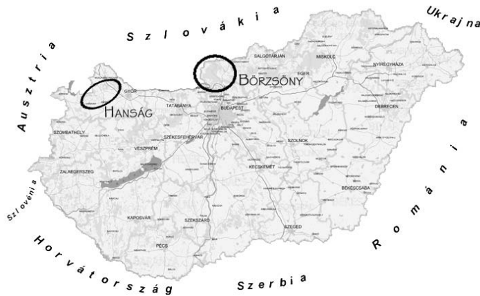
Figure 1: The Hanság and the Börzsöny in Hungary.

At the selection of the areas we considered certain conditions important as boarder situation, existence of natural values of high quality, protected areas of national importance, spatial scale of 20-25 settlements. The similarity of these factors ensures the similarity of the background conditions (from the point of view of economy and politics). So the differences in the competitiveness factors come up as distinctiveness inside the area.