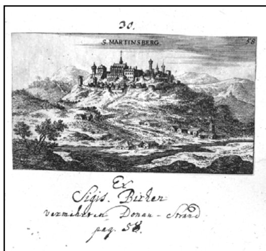
Figure 1: The abbey in 1680 (Benedictine monastery on St. Martin-Hill) [7]

The watchword of abbeys is “Cruce et aratro” at the Benedictines, that is with “a cross and with a plow”. The Benedictine monasteries established flourishing agriculture during a short time all over Europe. Townships and villages were born at the foot of monasteries [3]. The centre of the national Benedictine order is Pannonhalma, which is the earliest founded monastery. It was founded by Grand Prince Géza in 996, but that work was finished by St. Stephen [5]. The farming was on the St. Martin’s Hill and the surrounding area from 11 th century, at bottom of the slope and in valleys there was arable cultivation, three-crop rotation was applied while on slopes there were vineyards [3]. For the order to be able to do farming, it also was necessary to destroy forests. On a 1680 depiction ( Figure 1 ) the monastery’s building is well discernible. The depiction was made after the expulsion of the Turkish, and accurately reflects the fact, that during the occupation the area was completely deserted the nature took control of the area. The settlers broke up virgin lands again, but the growing population prompted them to make many great cultivated areas.