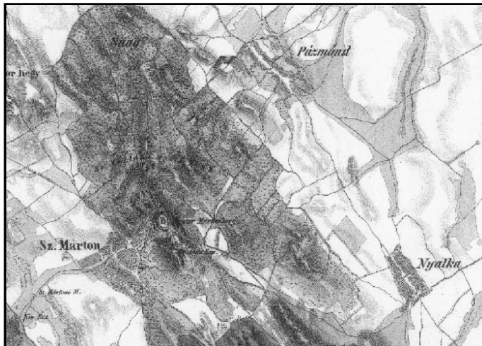
Figure 2: Pannonhalma and its neighbourhood in the first military survey [8]