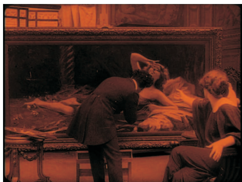
Figure 1. Il fuoco (Giovanni Pastrone, 1915). Figure 2. Il quadro di Osvaldo Mars (Guido Brignone, 1921).