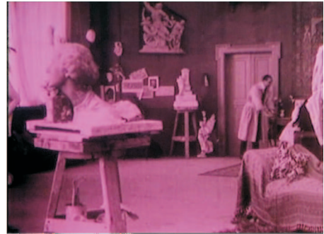
Figure 7. La madre (Giuseppe Sterni, 1917). Figure 8. La fuite en Egypte (Maxime Dastugue, 1889). Illustration.