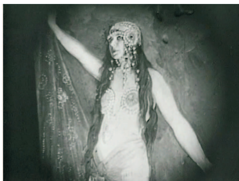
Figure 3. La modella (Ugo Falena, 1916). Figure 4. La notte che dormii sotto le stelle (Giovanni Zannini, 1918).