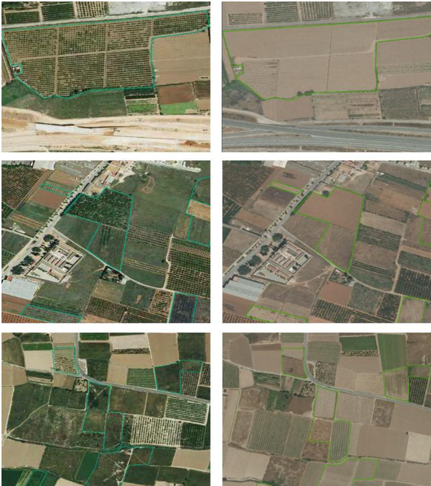
Figure 2. Examples of newly cultivated areas in the Horta de Faitanar (19), Horta de Picanya (24), and Horta de Campanar (14) between 2008 and 2013

When analysing land-use evolution unit by unit, results show different patterns of land-use changes ( Figure 3 ) as follows: