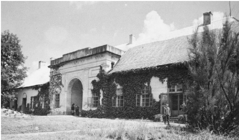
Figure 1. The Corunca Castle from 1930

The ancient castle was ravaged by the Szeklers during the reign of John Sigismund Zápolya, Prince of Transylvania, in 1562. More than a century later, Mihály Tholdalagi, the new owner of the estate, had it completely rebuilt. Ferenc Tholdalagi, one of the descendants of the Count, extended it in 1829, based on the plans of Joseph Weixlbraun. The building, having a U-shaped ground plan, was completed with a 50-metre neoclassical façade, with semi-cylindrical, coffering, barrel vault style passage in its median avant-corps of the central axis. The proportional dimensions and subdued decorations place the castle among the most beautiful classicist-style castles (Fig. 1.) [3].