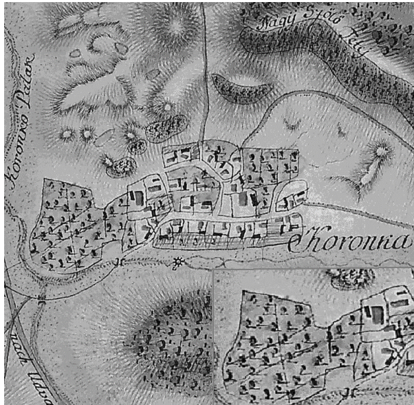
Figure 2. The military map of Corunca (Josephinische Aufnahme 1769–1773)