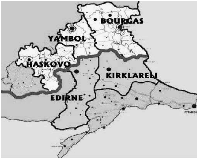
Map 2. The Bulgaria-Turkey crossborder region